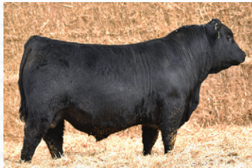
GF POWER MOVE 218H | Maternal Brother