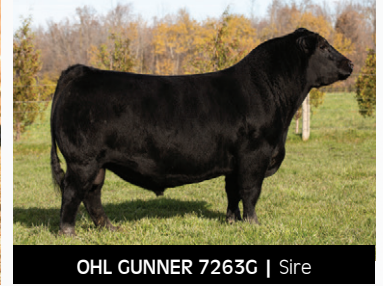
OHL GUNNER 7263G | Sire