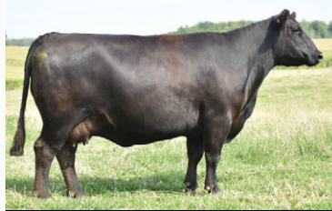
KEMP BROTHERS BAILEY 52D | Grandam