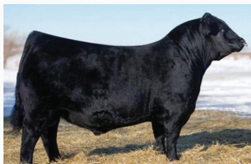
YOUNG DALE DEFIANCE 199F | Sire