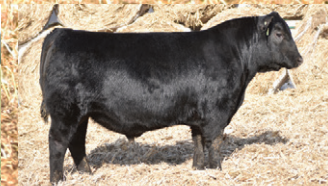
GF POWERCHIP 328G | Maternal brother