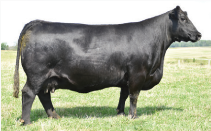
PM TIBBIE 4'15 | Grandam