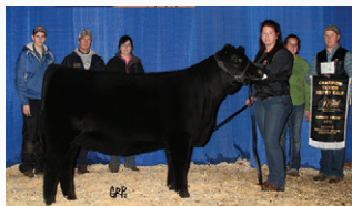
GF BARBARA 6A | Dam