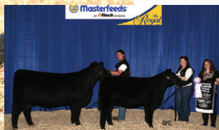
GF CRUSHMAID 100B | Dam