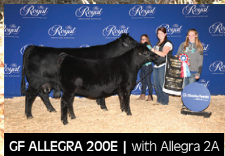
GF ALLEGRA 200E | with Allegra 2A