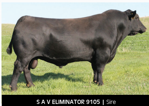
S A V ELIMINATOR 9105 | Sire

R R RITO 707 IDEAL 3407 OF 1418 076 S A F 598 BANDO 5175 S A V ABIGALE 6062 CONNEALY ONWARD SITZ HENRIETTA PRIDE 81M BOYD NEW DAY 8005 JUNE OF PEAK DOT 813P