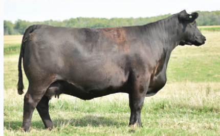
GF PURE PRIDE 5C | Maternal Sister to Dam