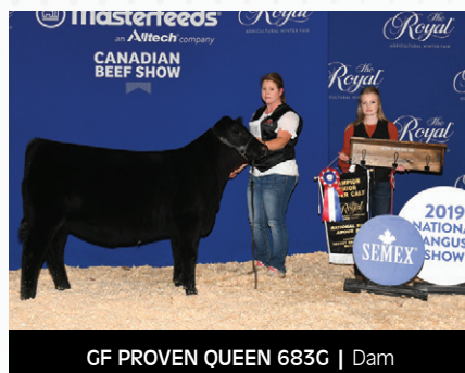
GF PROVEN QUEEN 683G | Dam

CONNELLY SHREK 4242 BLACKTOP BANDOLIER LADY 333 VIN-MAR O'REILLY FACTOR BRIDGEHAVEN JENA 5W EXAR BLUE CHIP 1877B 5T MISS WIX 8002 LEACHMAN SAUGAHATCHEE 3000C GREIMAN JENSEN PROVEN QUEEN7