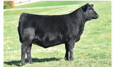
GF PURE PRIDE 5H | Maternal Sister to Dam