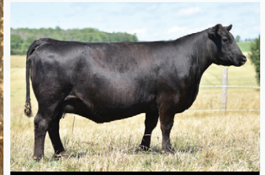
GF MERCEDES 328C | Grandam