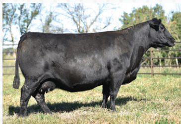
JL LADY 3059 | Dam

PF HOOVER DAM 041 BLACK HAMCO COUNTLESS 417T YOUNG DALE PANARAMA 66T YOUNG DALE GRACE 19T CONNEALY ONWARD SITZ HENRIETTA PRIDE 81M BOYD NEW DAY 8005 JUNE OF PEAK DOT 813P