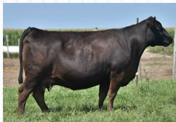
JL FOREVER LADY 6104 | Dam

COLEMAN CHARLO 0256 S A V PRESIDENT 6847 S A V BLACKCAP MAY 4136