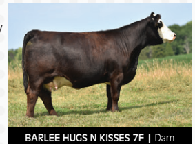
BARLEE HUGS N KISSES 7F | Dam