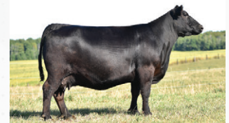
GF BLACKBIRD 304B | Dam