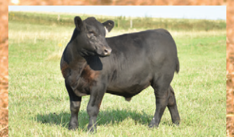
PICTURED AS A CALF