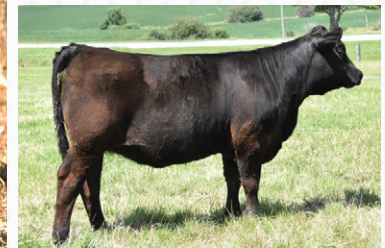
GFA 291 | Maternal sister to dam