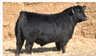
GF POWER AND CLASS 403H