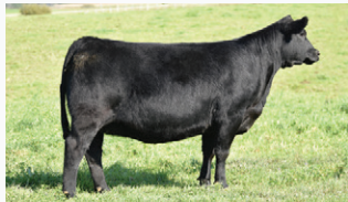
GF RITA 166E | Dam