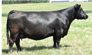
GF EVENING TINGE 17Y | Grandam