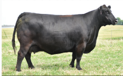
FRANCISCO PURE PRIDE 5A | Grandam

SELLING ONE HALF INTEREST FULL POSSESSION