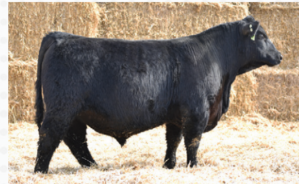
GF RED LIGHT 1440H | Maternal Brother