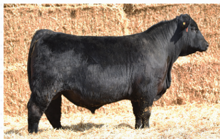
GF GROWTH FUND 905H | Maternal Brother