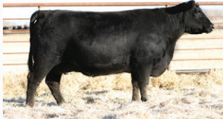
JL PRIMROSE 4081 | Dam

This attractive smooth put together bull is backed by an Eliminator daughter who is deep sided, highly productive and possesses an incredible udder. Another solid Blackstock son who is capable of adding performance in a balanced package.