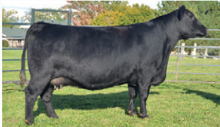
GF RITA 66Z | Maternal Sister to Granddam