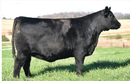
GF TIBBIE 440H | Maternal Sister to dam