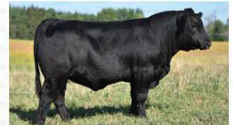
POWER DRIVE 304J | As a calf