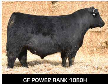
GF POWER BANK 1080H