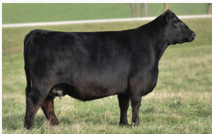
GF JENA 905E | Dam

If you are into producing high performance cattle that have growth, carcass and maternal attributes, Local Legend checks all these boxes. A maternal brother to the $40,000 high selling bull GF Lucknow 905G, Local Legend is going to leverage that powerful dam and take data to new heights. No other bull in the entire Canadian Angus association database can match Local Legend for his combination of WW,YW,RADG, MARB and HPG. Local Legend posted an actual yearling weight of 1510 pounds taken 10 days before his first birthday.