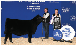
GF BARBARA 63G