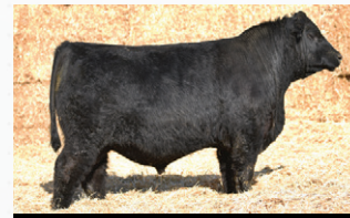
GF ENDLESS 361H | Maternal brother

Power and growth and backed by a proven productive cow family. If you are looking for maternal traits, the Barbara cow family will inject a healthy dose into your herd through this high growth individual. Ranking in the top 1% of the breed for milk and daughters' pregnancy rates in the top 20%, this bull will produce those highly maternal daughters that we need to keep the future bright.