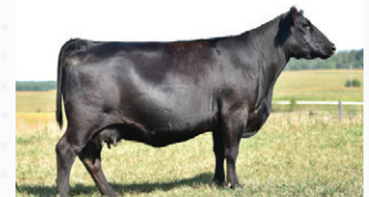
GF BLACKBIRD 304D | Maternal Sister