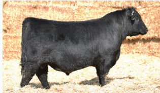
GF DARK SECRET 166H | Maternal brother