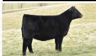
GF BLACKBIRD 403G | Dam