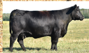
GF MERCEDES 328D | Dam