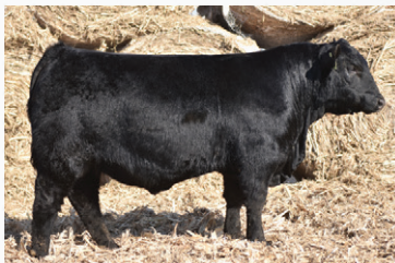
GF RAINFALL 218G | Maternal Brother

SITZ TOP GAME 561X JMB EMULOTA 013 S A V FINAL ANSWER 0035 FROSTY ELBA LIZZY 1106 EXAR BLUE CHIP 1877B 5T MISS WIX 8002 LIMESTONE DARKHORSE U322 WHITESTONE RITA 666T