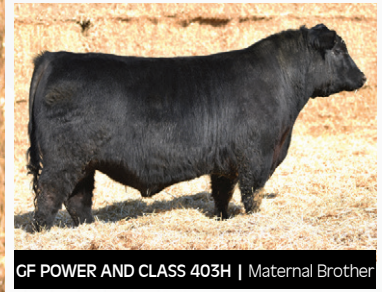
GF POWER AND CLASS 403H | Maternal Brother