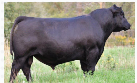
GF LUCKNOW 905G | Maternal Brother