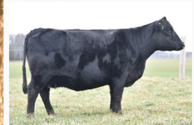
GF MERCEDES 219F | Dam